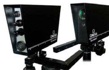
PHOTO-FINISH COLOR CAMERA

The Scan'O'Vision Star photo-finish camera delivers high performance time measuring at the finish line with 2000 shots per second.