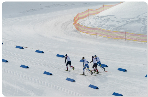
Asian Winter Games in Astana-Almaty