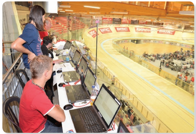
Timing room during a Cycling Track event